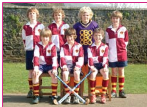
U11 Hockey - IAPS Plate Tournament winners, semi-finalists County Tournament, Canford Tournament winners