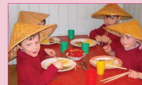
Reception Class enjoy Chinese food they made in class to celebrate the Chinese New Year.