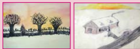
Twigia Drewett 7L Luke Holland 6G