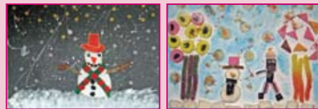
Bluebelle Wood 1B Lolly Bruce-Jones 7D

There was a huge response to enter the art competition over the Christmas holidays. Mr Somerville was delighted with the thoughtful entries; the winners are shown below: